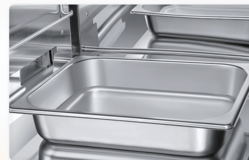
① Stainless steel liner& water pond