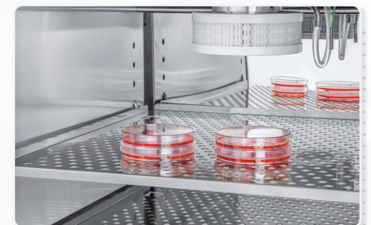
② High efficiency filtration system