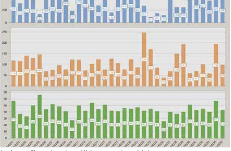
Analyzer - Charts (number of licks, nosepokes, visits)