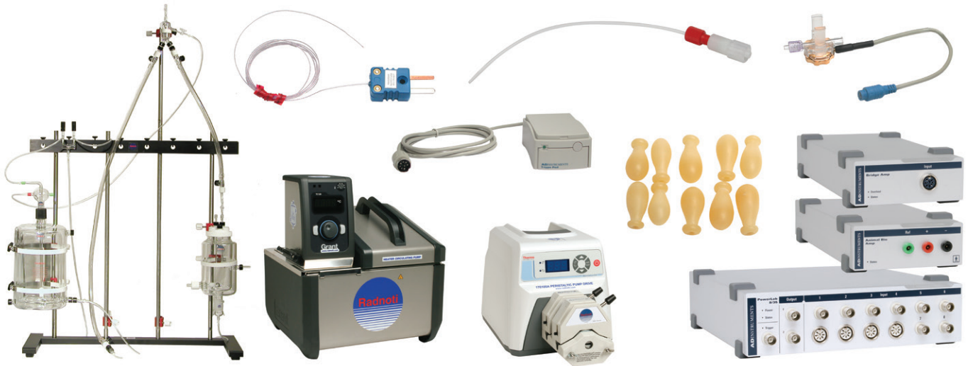
Key components of the Langendorff system for rats. For a full list of components visit adi.to/complete

Study heart function with ADInstruments versatile Langendorff systems. Systems include modular Radnoti glassware and comprehensive LabChart Pro software for powerful analysis.